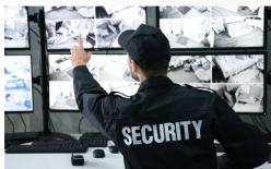
24*7 SECURITY (PROVIDED BY COLONISER)