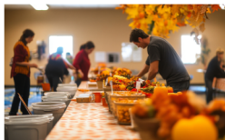
COMMUNITY HALL (PROVIDED BY COLONISER)