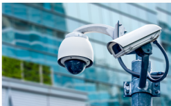
CCTV SURVEILLANCE (BUILDING PREMISES COVERAGE ONLY)