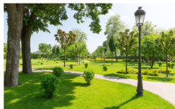
LANDSCAPED PARK (PROVIDED BY COLONISER)